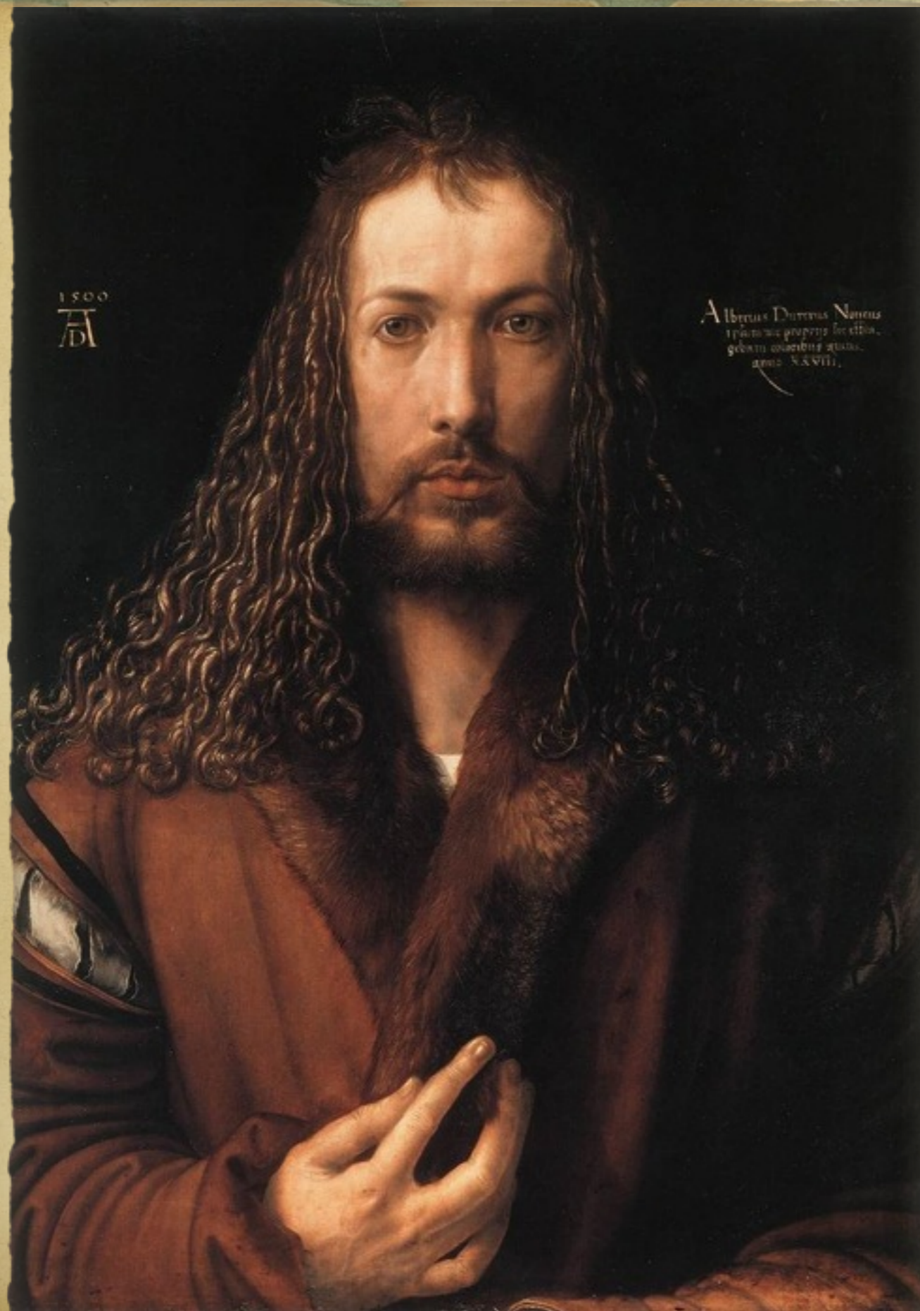
Albrecht Durer, Self-Portrait in Fur Coat, 1500.

Albrechtus Durerus Nurembergensis in propria se effigie, genitum coloribus suis, anno M o CC o XXVIII.